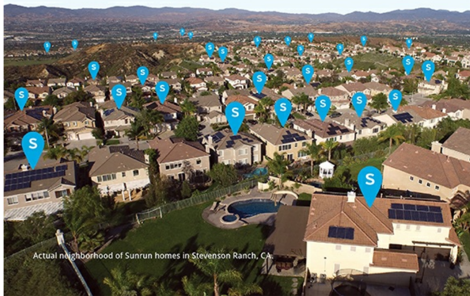
Actual neighborhood of Sunrun homes in Stevenson Ranch, CA.

1.6 billion avoided pounds of CO 2 emissions